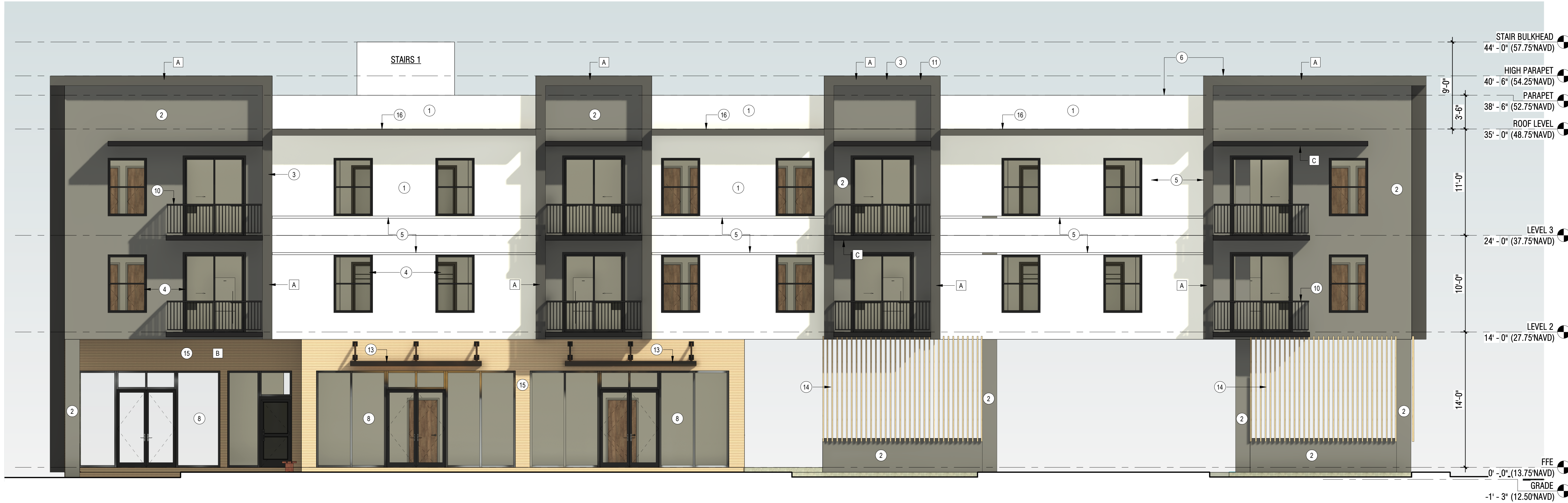
1 SOUTH ELEVATION (FRONTAGE) SCALE: 3/16" = 1'-0"